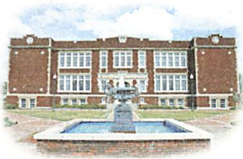
ANDALUSIA CITY HALL